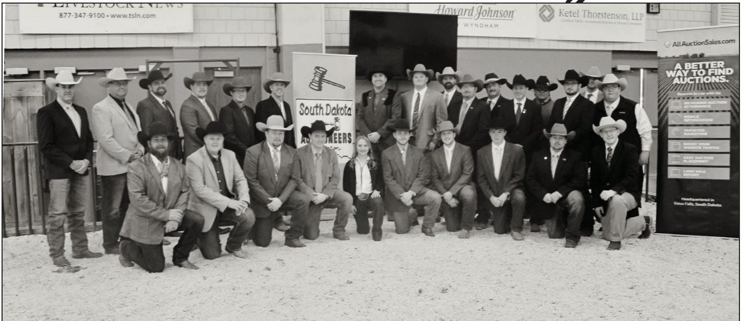
2022 Black Hills Stock Show 25 contestants. Allauctionsales.com sponsored our plaques this year.