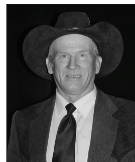
2019-2020 SDAA PRESIDENT OF CHAMBERLAIN, SD