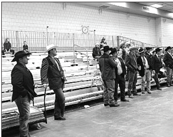
Contestants getting ready