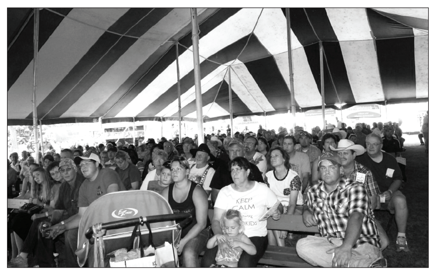
A full tent of people! With the help of the 4-H Foundation we raised a lot of CASH!