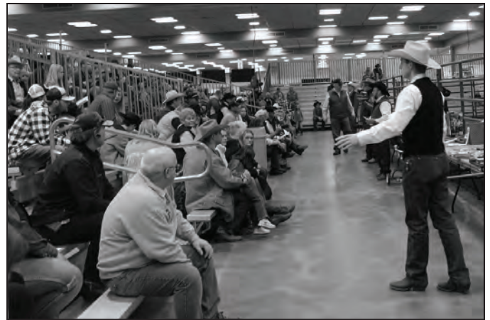
Contestants helping taking bids and working the crowd.