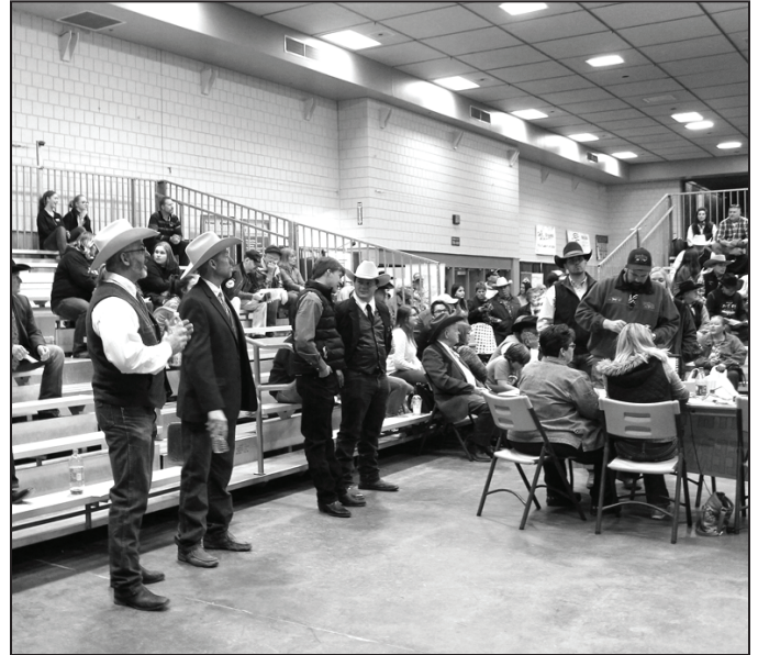
Contestants waiting their turn to auction.