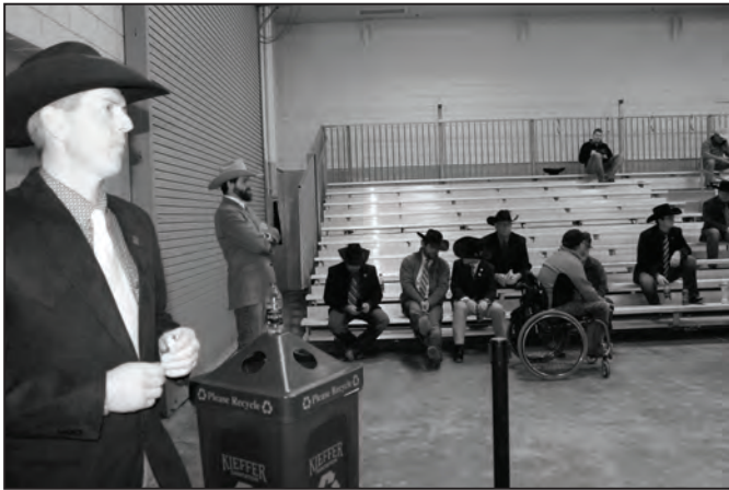
Contestants waiting their turn to auction