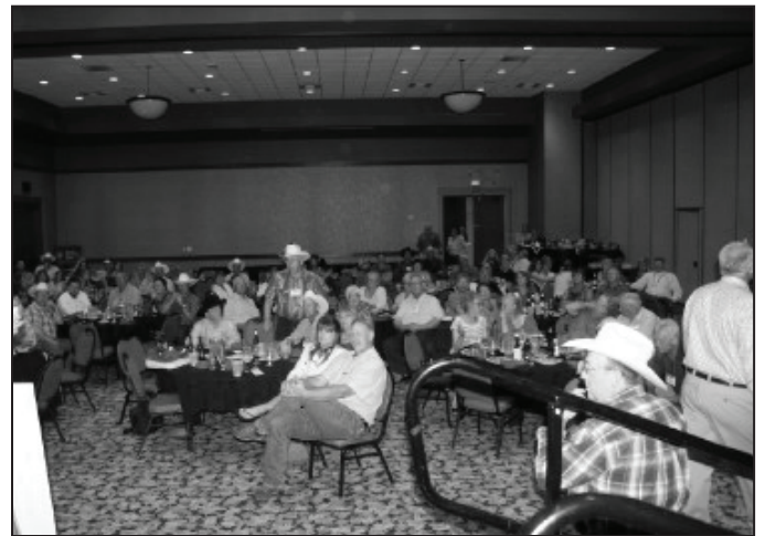
Fun auction group.