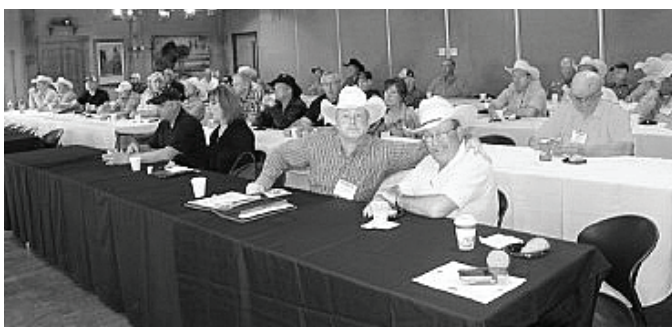
Class room at Joy Ranch.