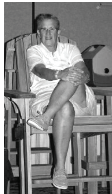
1st Lady taking a break