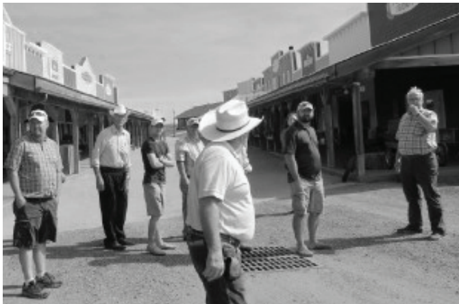
Joy Ranch Main Street.