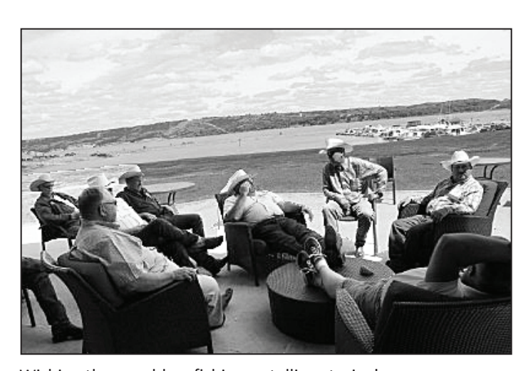
Wishing they could go fishing or telling stories!