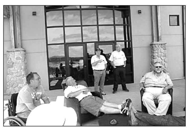
And than again just to visit on break